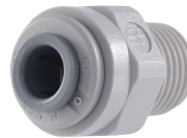
#18005 1/2" x 1/2" BSP-M Connector