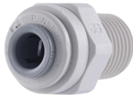
#18003 1/2" x 3/8" NPS-M Connector