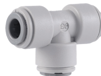
#18015 1/2" Union T Adapter