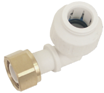
#10960 1/2" NPS-F to 15 mm female speedfit slip joint with 90° elbow