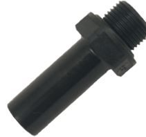
#10959 3/8" BSP-M to 15 mm male speedfit slip joint