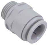
#10956 1/2" NPS-M to 15 mm female speedfit slip joint

If you are going directly to 15 mm PEX tubing, this piece will make your life easier when installing a pull-out shower or recessed shower. The 3/8" hose fitting fits this adapter and the other end is a 15 mm male slip joint.